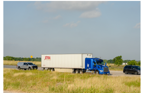
Law enforcement vehicle conducting pull over of an Embark-powered truck.

https://www.globenewswire.com/NewsRoom/AttachmentNg/f0a4c912-9307-465b-9a8e-5e8ea4a85b63