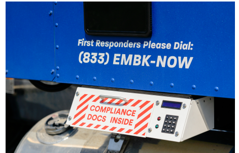
Prototype law enforcement interaction features, including autonomous truck status display (top, currently off), support phone number decal, and compliance document lockbox.