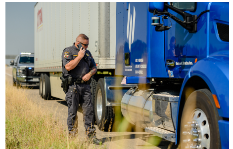
Example of a law enforcement officer approaching an Embark-powered truck.