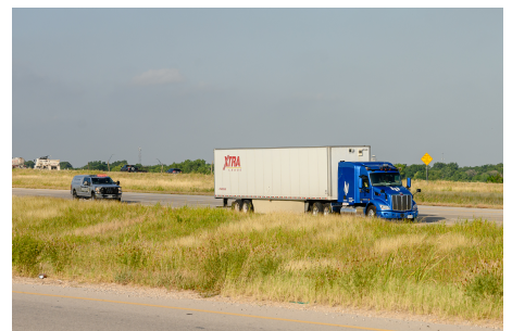
Law enforcement vehicle conducting pull over of an Embark-powered truck.